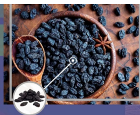
SAYAKI BLACK RAISINS