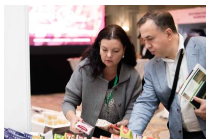
PHOTO CENTRAL ASIA TRADE FORUM 2017 TRADE EXHIBITION