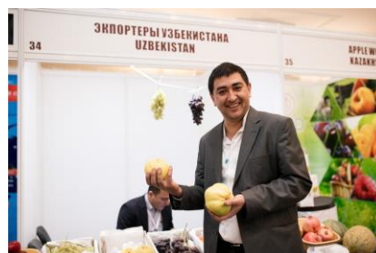
PHOTO CENTRAL ASIA TRADE FORUM 2017 TRADE EXHIBITION