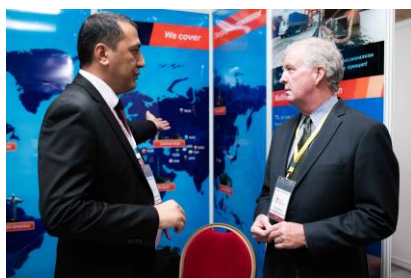
PHOTO CENTRAL ASIA TRADE FORUM 2017 TRADE EXHIBITION